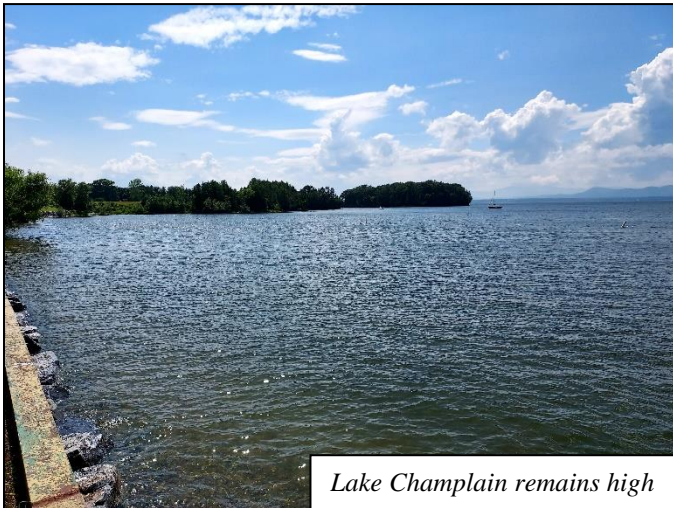
Lake Champlain remains high