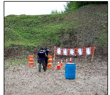
Police officers training at an outdoor firing range.

The Town of Shelburne's payroll is about $100,000 per week? It peaks in the summer, when lifeguards and other seasonal staff push the employee count over 100. Several jobs are vacant, and we are hiring now!