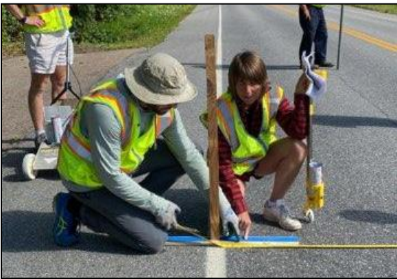
Demonstration project in progress on Spear Street

Our local government is primarily a team of public servants. In order to provide the high level of services residents expect, the Town will need to add staff. In preparing next year's budget, I will study workloads and identify the services where improved staffing will do the most good.