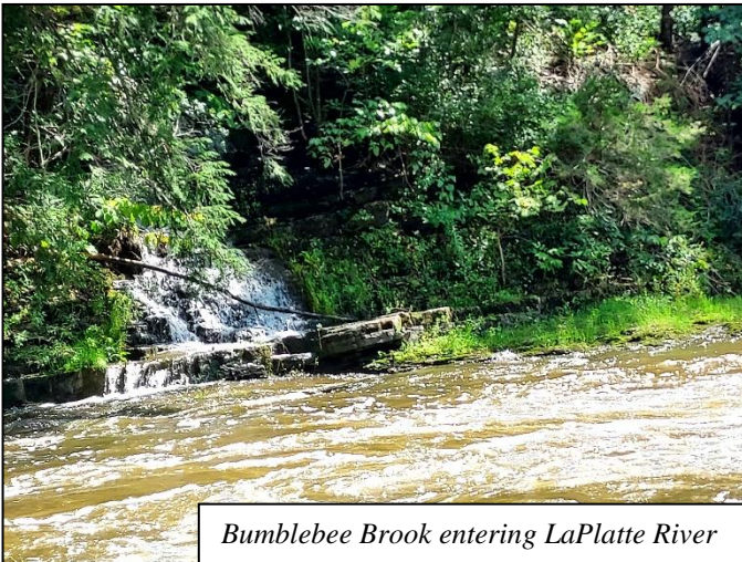
Bumblebee Brook entering LaPlatte River