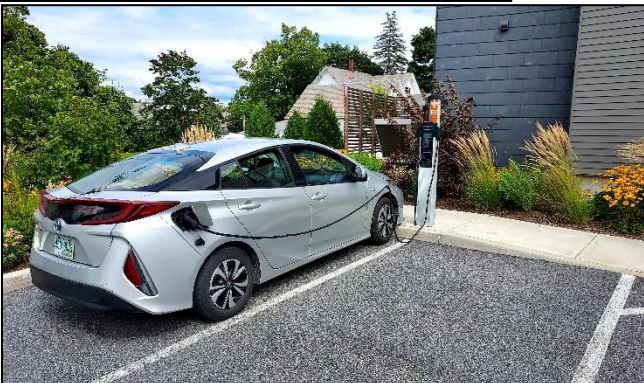
Pierson Library's public EV charger in use

New, temporary bike lanes! Spear Street shows off some new ideas for safer ways to walk, run, or bike. The pop-up is a project of volunteers, the Local Motion nonprofit, and Town staff. Try it and take the survey before September 10 th !