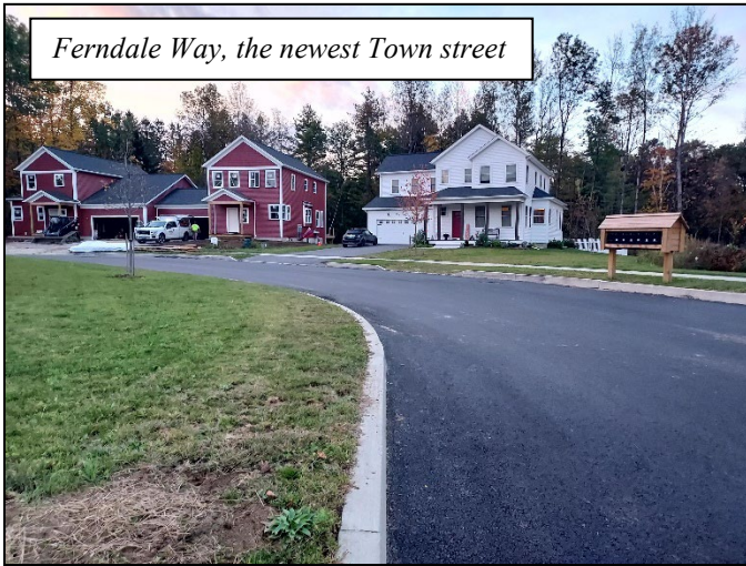
Ferndale Way, the newest Town street