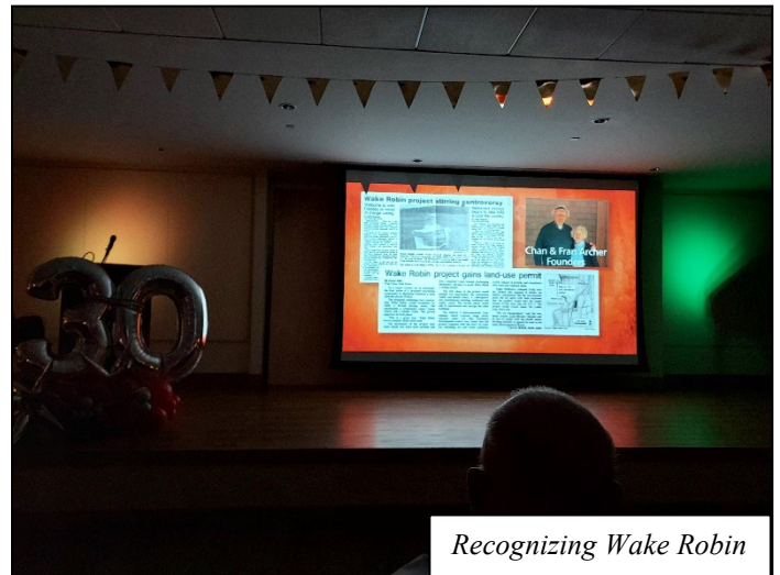
Recognizing Wake Robin

I appreciate learning all this and working together!