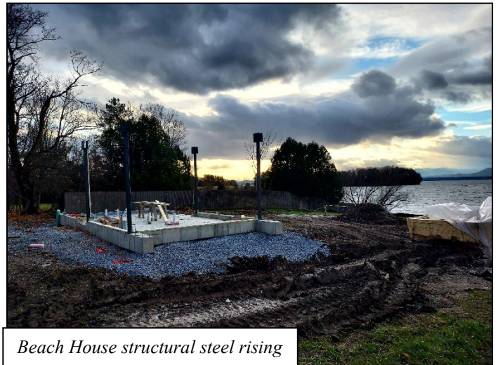
Beach House structural steel rising

With a lot of help from American Rescue Plan funding, the Town pushes forward on several notable construction projects. The new beach house is an active job site, and the steel columns just went up. That project has a fantastic team of local businesses, volunteers, and Town staff. This month, the Selectboard voted to accept a construction contract for the Falls Road bridge, and make a final grant application for it. Costs to build here keep rising. I feel a sense of urgency.