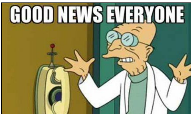
Professor Farnsworth from the animated series Futurama