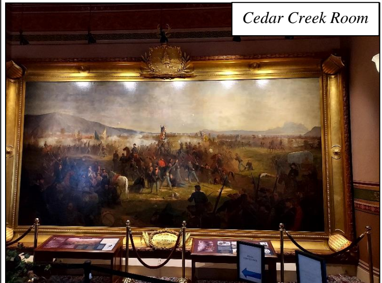
Cedar Creek Room