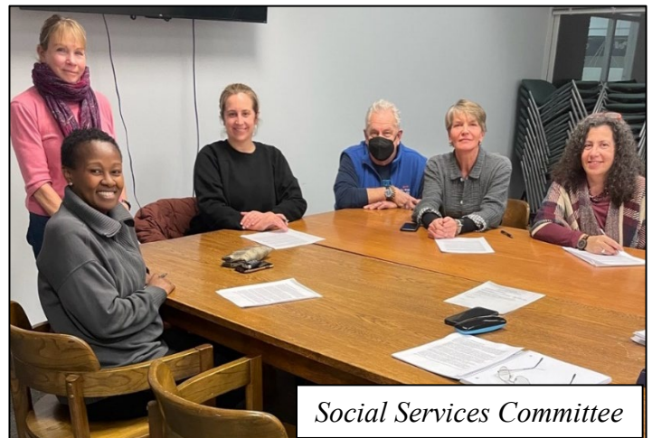
Social Services Committee