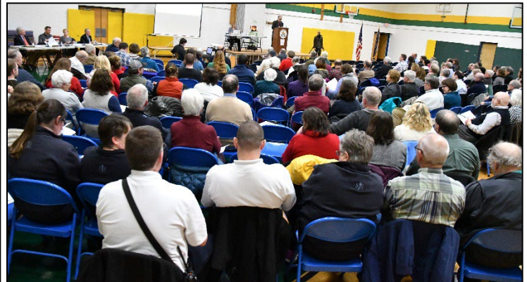
Shelburne Town Meeting

I look forward to joining the tradition and sharing an evening of civics. See you there!