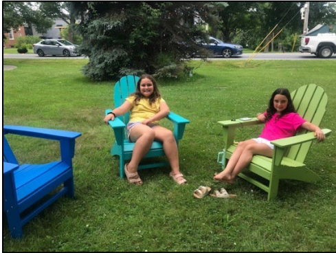
Take the survey about the Falls Rd.

I aim to become a better local government leader and share best practices around Shelburne, Vermont, and beyond. The Town fully pays this endeavor, investing in the future of our workforce. My program lives in the College of Agriculture. It's a PhD in "Sustainable Development Policy, Economics and Governance." How do we cultivate local democracy in time of demographic and climate change? This program has two dozen students from all over the world, from Shelburne to Chile, South Sudan, and Pakistan. UVM pulled $227 million of research grants last year: I hope to bring some new resources to Shelburne!