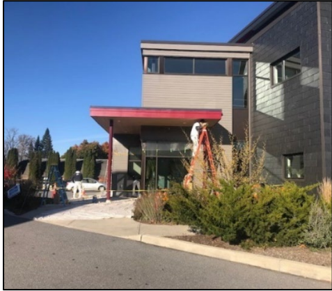
Town construction projects underway