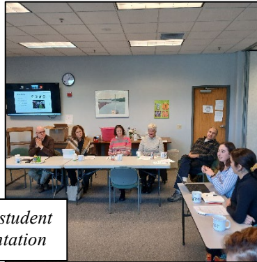
UVM student presentation